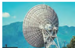
Communication base station