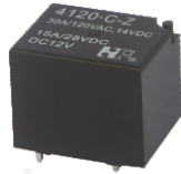
Wash tight 26.8×21.5×22.3