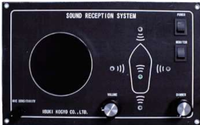
SRS Control Panel