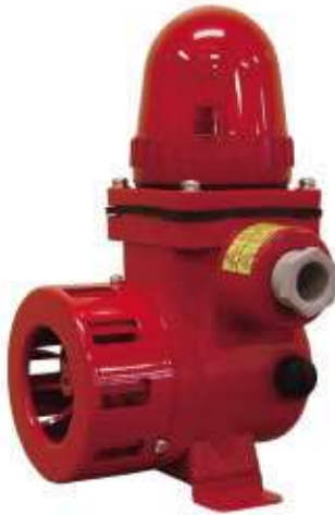
F30 with LAMP