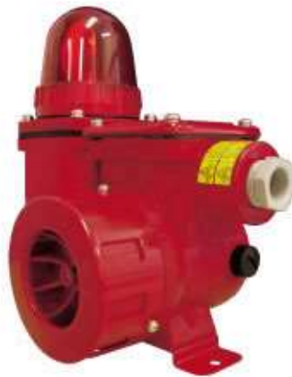
F30 with RF5