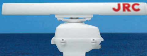
Scanner (3.9ft) for JMA-2344