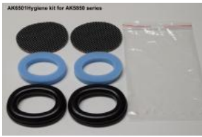
Hygiene kit for Headset