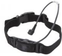
AK6070T Throat microphone for all A-kabel type Headsets

Headset stowage Bracket for Wall mounting