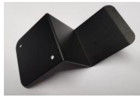
Headset Stowage Bracket

Spare Boom Microphone for all A-Kabel type Headsets