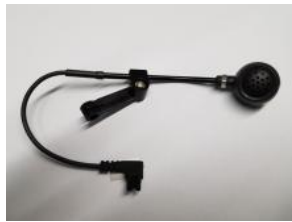
Spare Boom Microphone for Headset

Spare Boom Microphone for all A-Kabel type Headsets