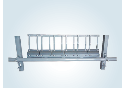
Alloy Rubber Cleaner (H-type)