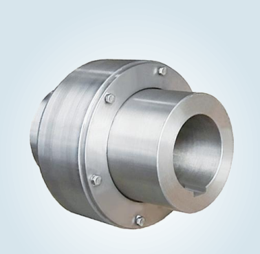
ZL Type Elastic Pin Tooth Coupling