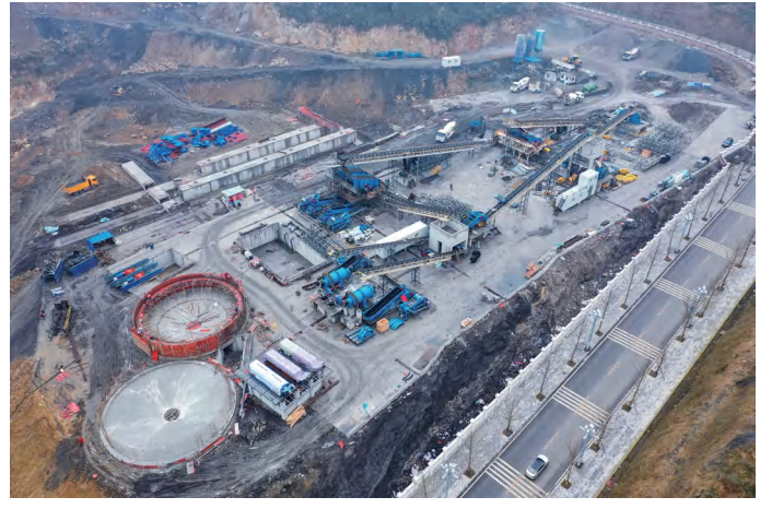
Tuxikou Reservoir Project — China Gezhouba Group Company Limited