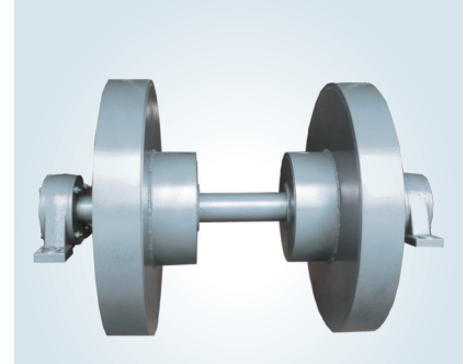
Diversion Pressure Wheel (for large tilt conveyors)