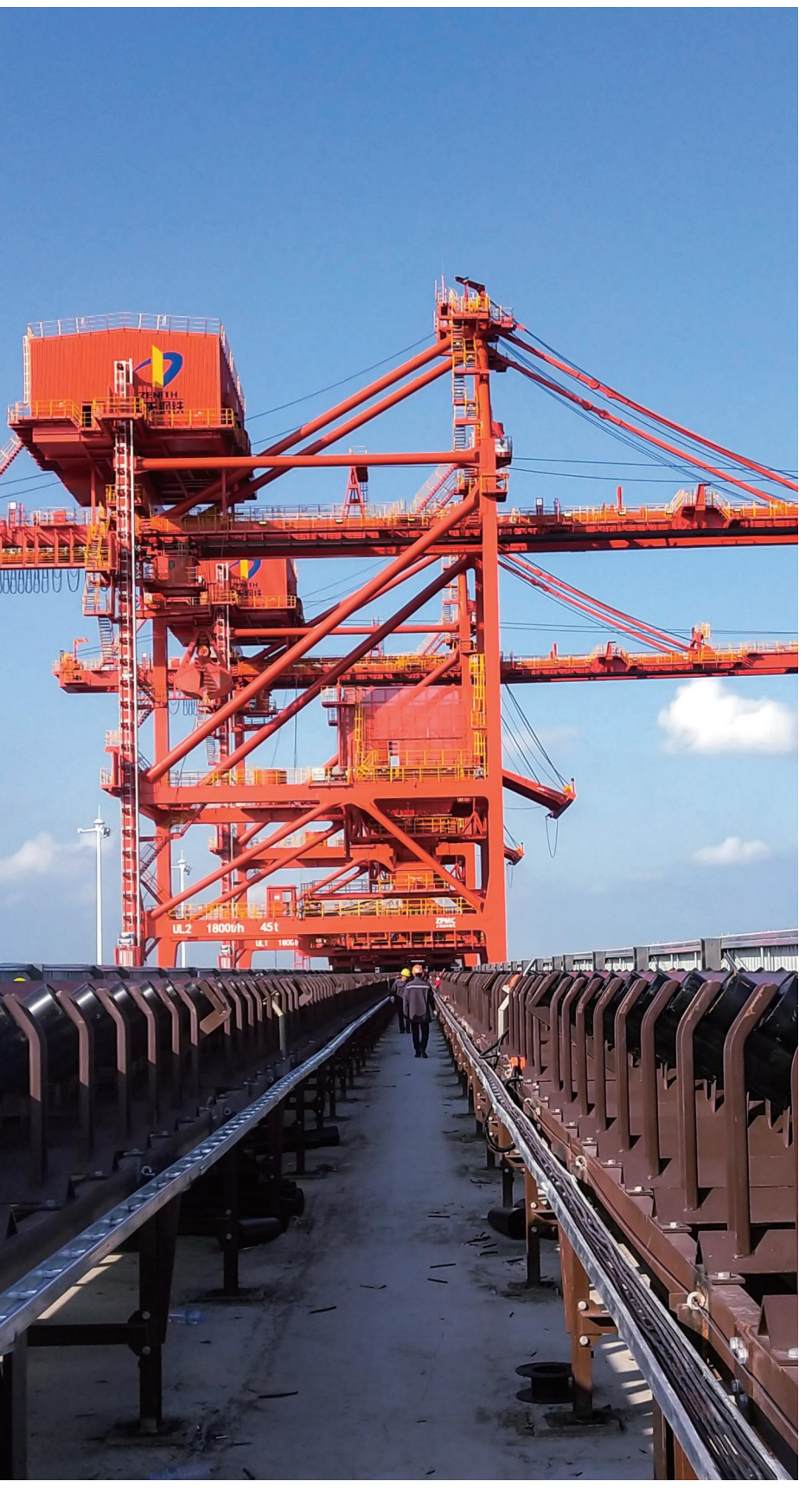
Zhongtian Nantong Haoyang Port