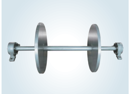
Diversion Roller (for ordinary conveyors)