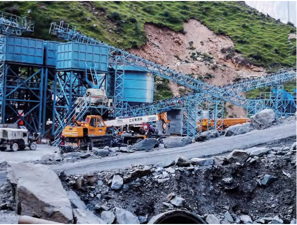
SK hydropower station of Pakistan — China Gezhouba Group Company Limited