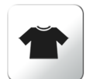
Supermarket Clothin Store