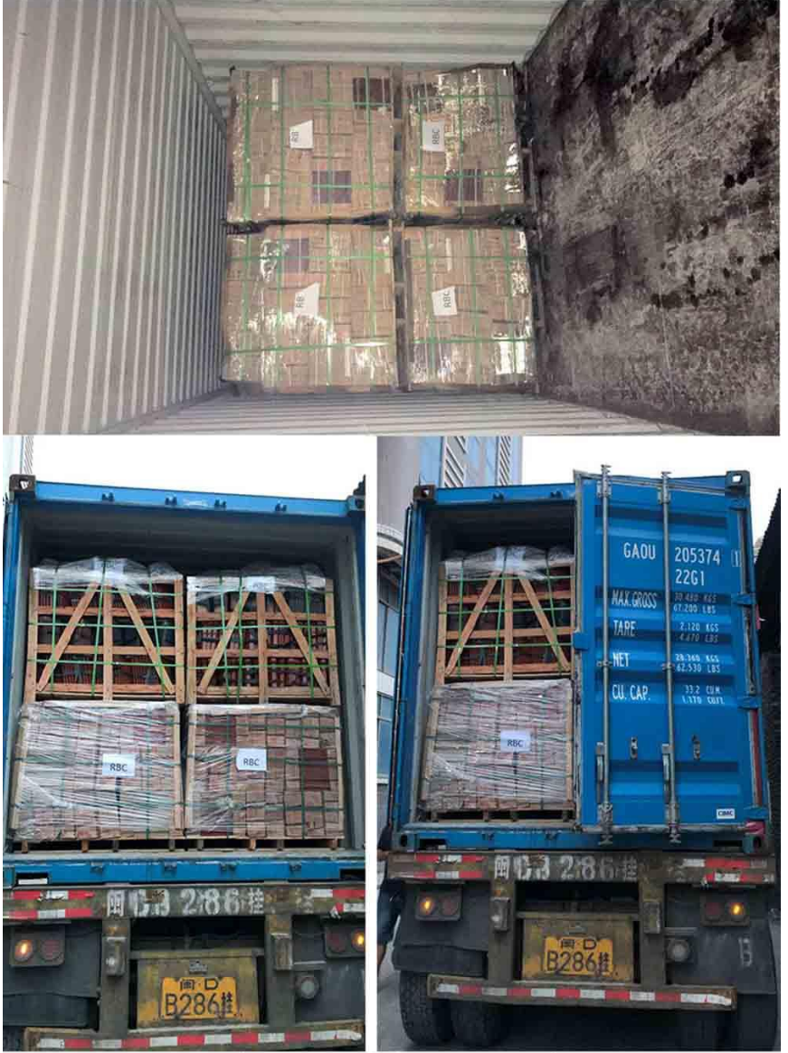
Wooden pallet packing