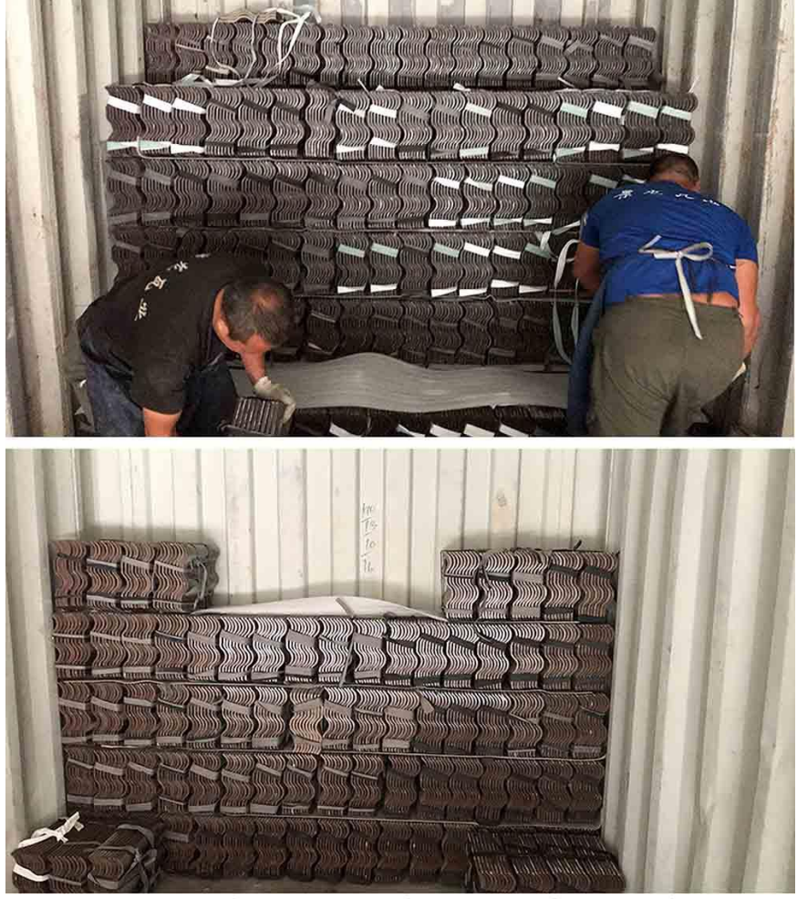
Loading with pearl wool