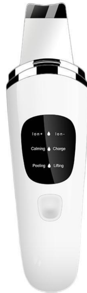
Model: GT-1929 classic style