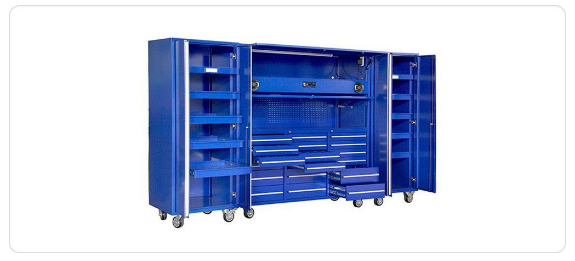
Qingdao Chrecary International Trade Co., Ltd.

The design and function of steel tool garage cabinet storage work station are very important. First, it needs to be strong and durable enough to withstand the weight of everyday use and storage tools. This requires the selection of high-quality metal materials and the use of strong structural design. Secondly, the storage cabinet should have multiple storage areas of different sizes to accommodate the size and shape of various tools. In this way, we can better organize and categorize tools to improve work efficiency. In addition, metal garage tool storage cabinets should also have anti-rust, moisture-proof and fire-proof functions to ensure the safety and long-term preservation of tools.