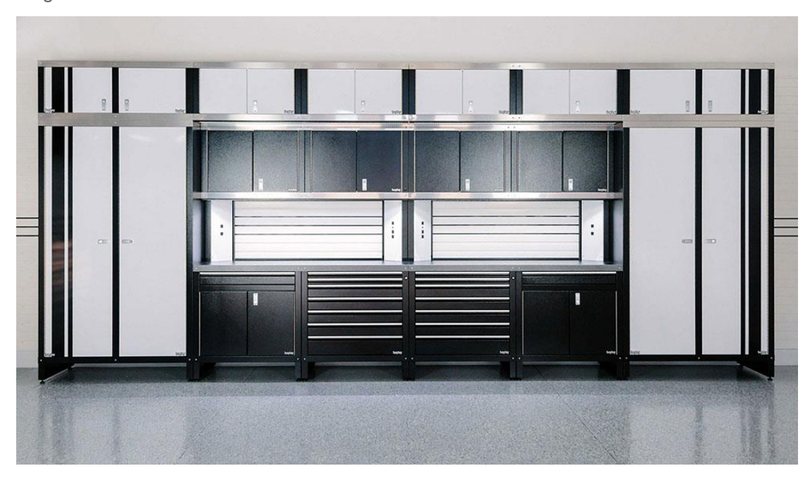
Qingdao Chrecary International Trade Co., Ltd.