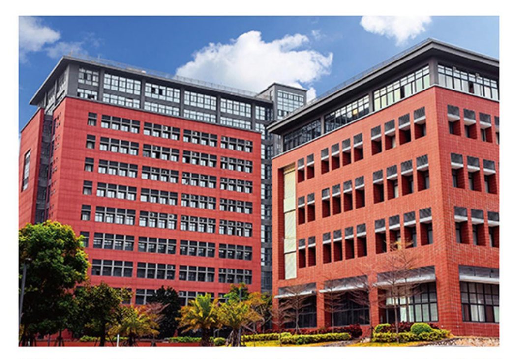
Baili Medical Supplies(Xiamen)Co.,LTD. is a high-tech biomedical company, devoted to the field of rapid diagnostic reagents and instrument. Baili is located in Xiamen, China, established in July 2013, which is a listed enterprises in Na-tional Equities and Quotations. As a technology-driven company that prides itself on its scientific excellence, Baili focused on technological innovation and roduct innovation with 15 authorized patents, each of our products embod-ies the creativity of our excellent scientists, who are working hard to continu-ously bring novel products to the China and world markets. SARS-CoV-2 rapid detection series of products, including SARS-CoV-2 antigen, antibody and influenza differential detection, are produced by Baili, which can easily and quickly carry out screening of SARS-CoV-2 in a large number of people, adding strength to epidemic prevention and control.