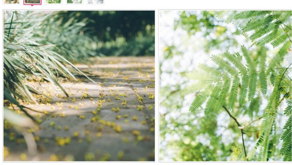
It fits my camera very well and it works very well.