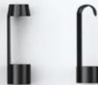
5 Lens accessories