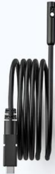
1 Dual lens line