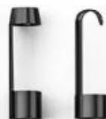
3 Lens accessories