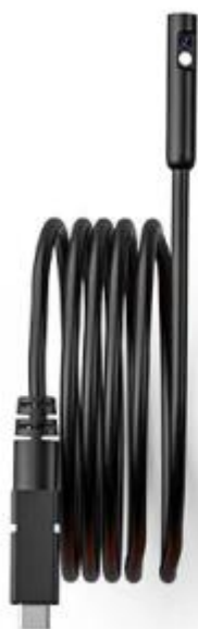
1 Dual lens line