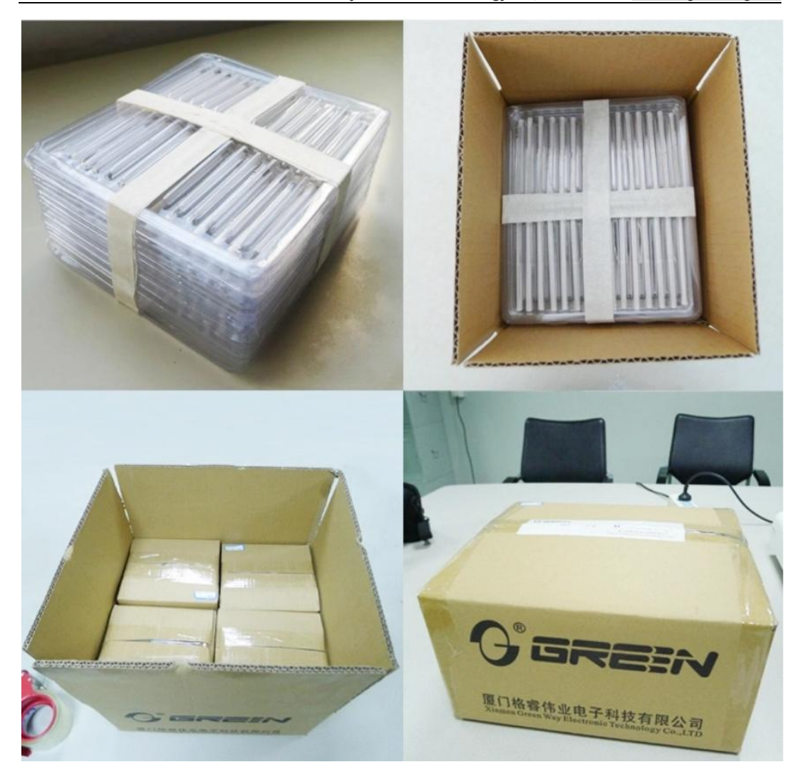
Fast International Express Delivery such as DHL,TNT,FEDEX, UPS ect.