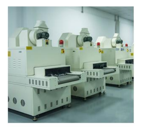
UV light machine