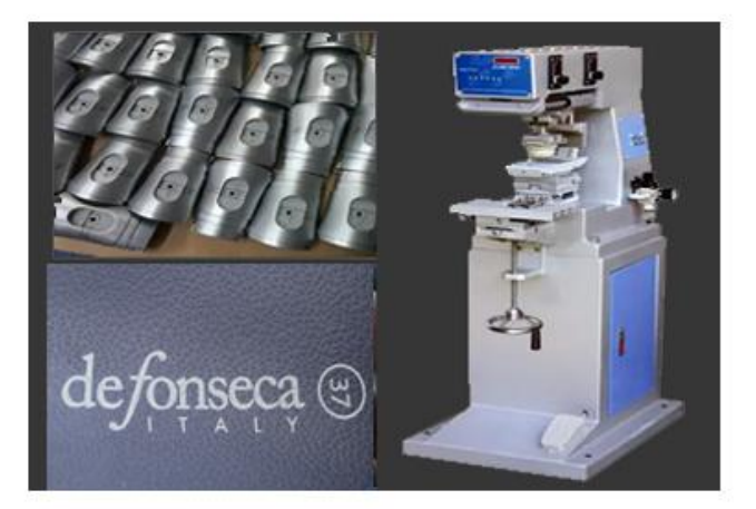
Pad Printing Machine