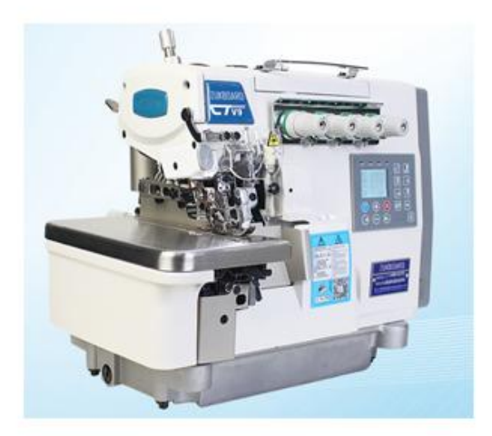
automatic welting machine