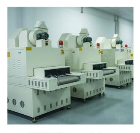
UV light machine