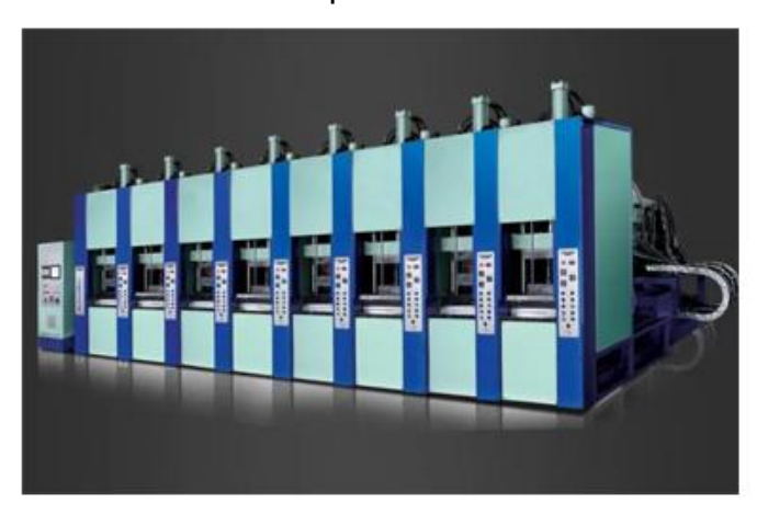
EVA injection machine