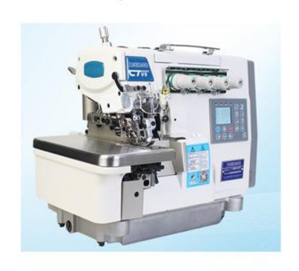
automatic welting machine