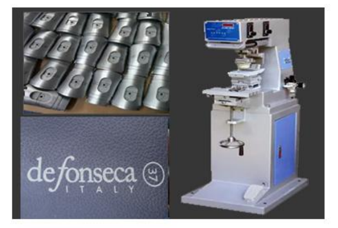
Pad Printing Machine