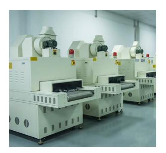
UV light machine