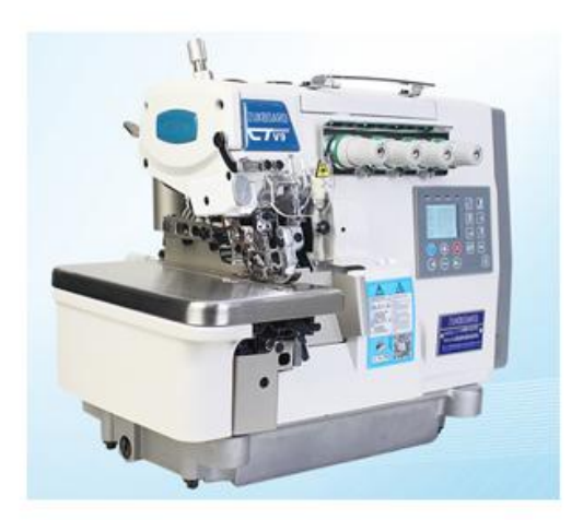
automatic welting machine