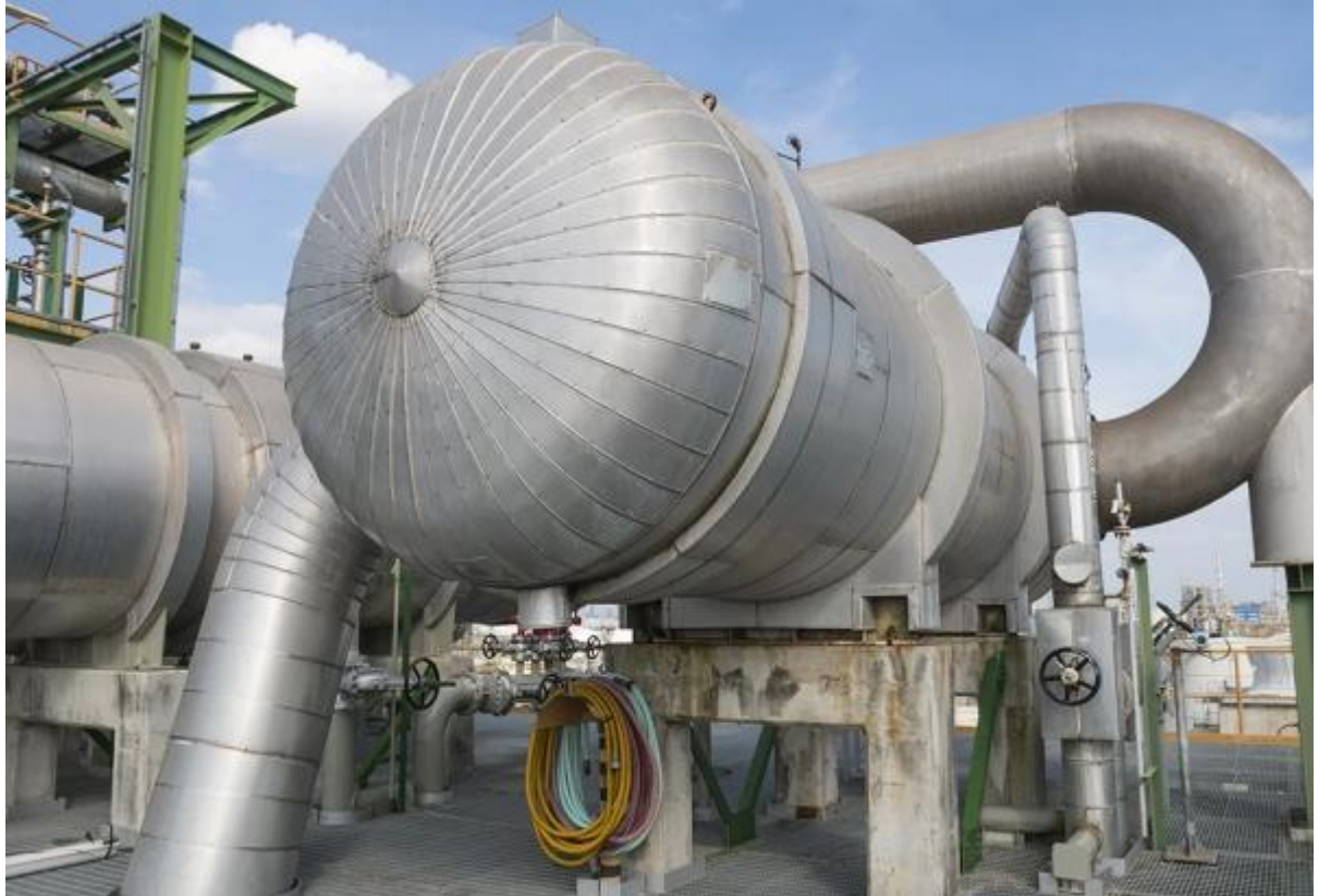
Details of the Bewell® Stainless Steel U-Tube Pipe For Heat Exchanger Boiler

Zhejiang Bewell Steel Industry Co.,Ltd. Phone:+86-18072196625 E-mail: bwss@vip.163.com