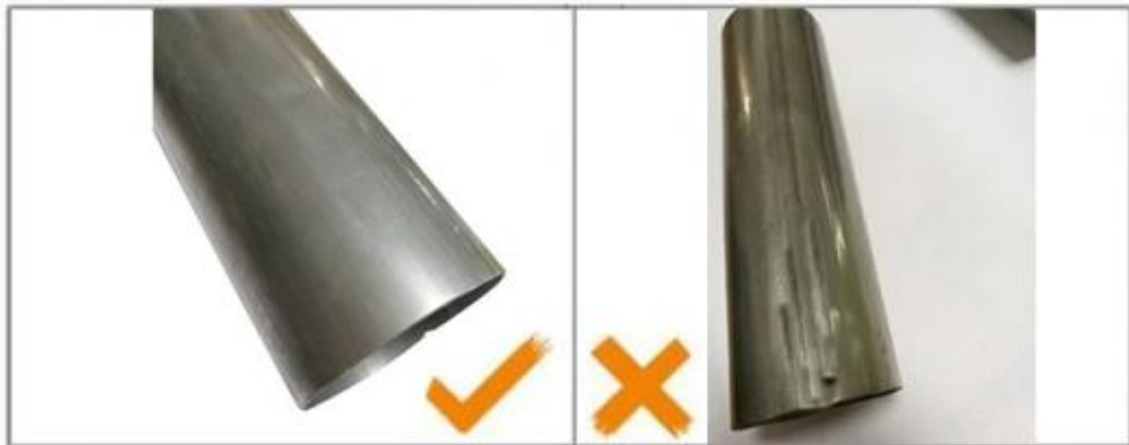
Qualified thickness and threads