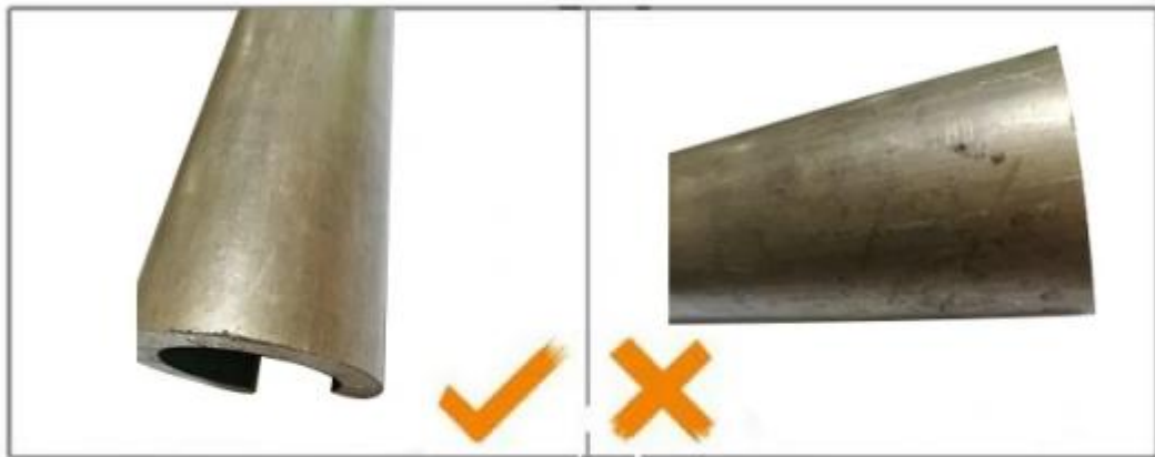
Crafted, outstanding details