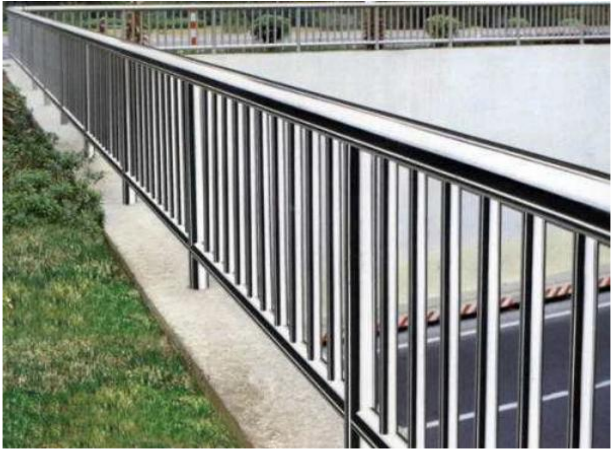
Details of the Bewell® S32304 Stainless Steel Seamless Pipe