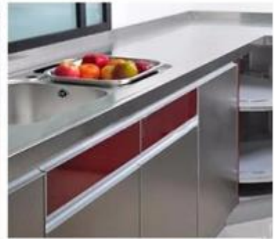
Details of the Bewell® 316 Welded Rectangular Tube