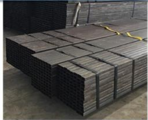
2. Smooth and bright surface