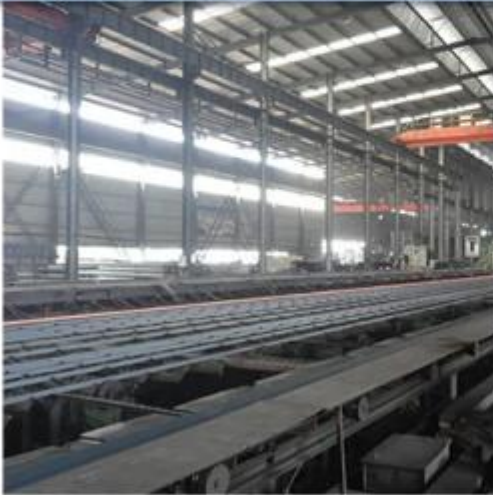
1. Steel hot pressed into rectangle Hollow perforation