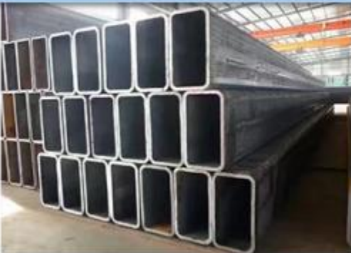
3. Interior is still smooth, wear-resistant no crack