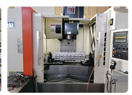
Four axis center