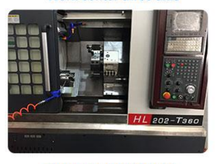
Oblique rail CNC lathe