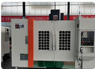
Work center three axis