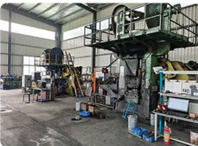
400 ton friction press