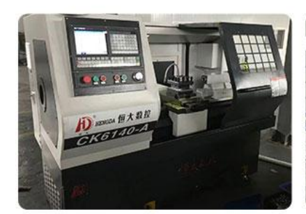
Flat rail CNC lathe