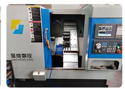
Small CNC lathe