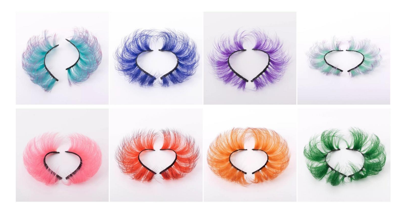
Make Your Own Package

Tel: +86-18563919529 E-Mail: info@sparklingeyelash.com