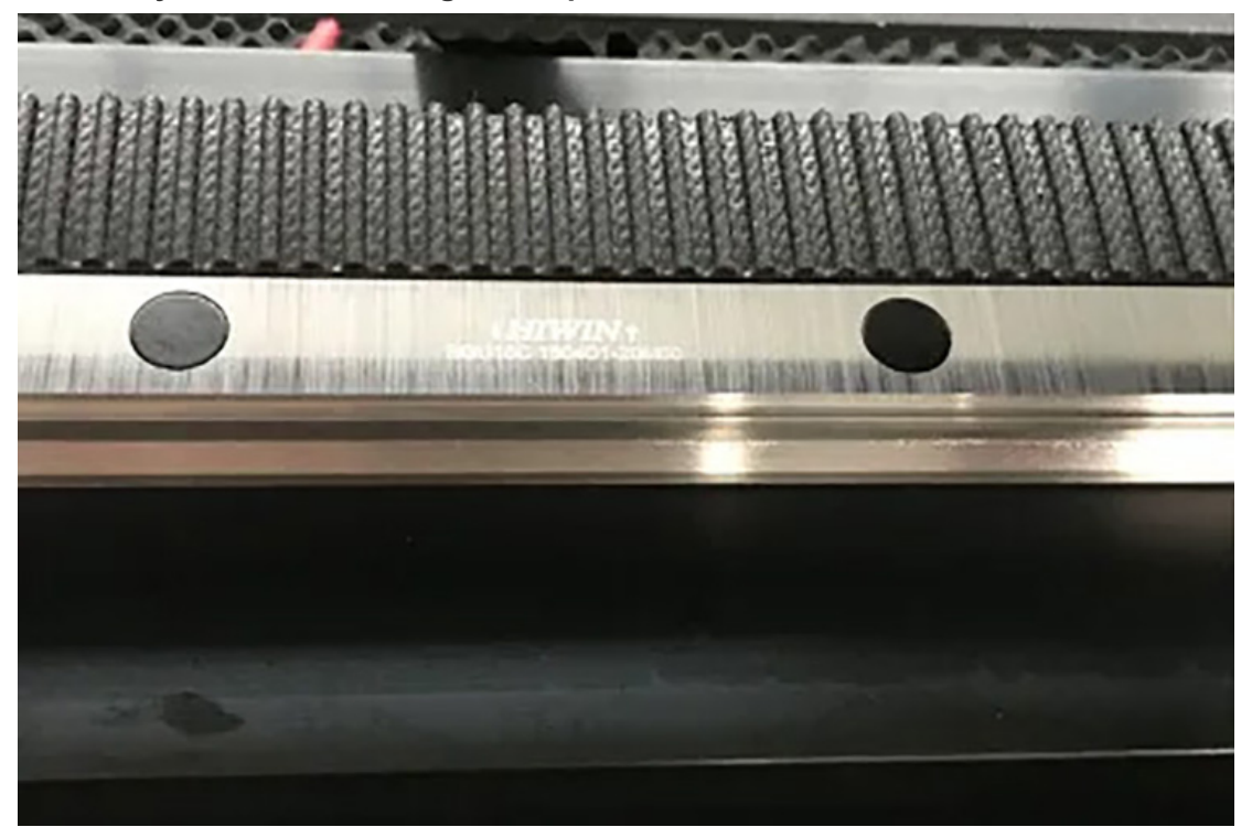
Adopted Taiwan HIWIN linear guide rail, fast running and high positioning accuracy for a longer time, improves the accuracy of engraving and cutting.

Cheap and good performance. Without A/D conversion, the digital pulse signal can be directly converted into angular displacement.