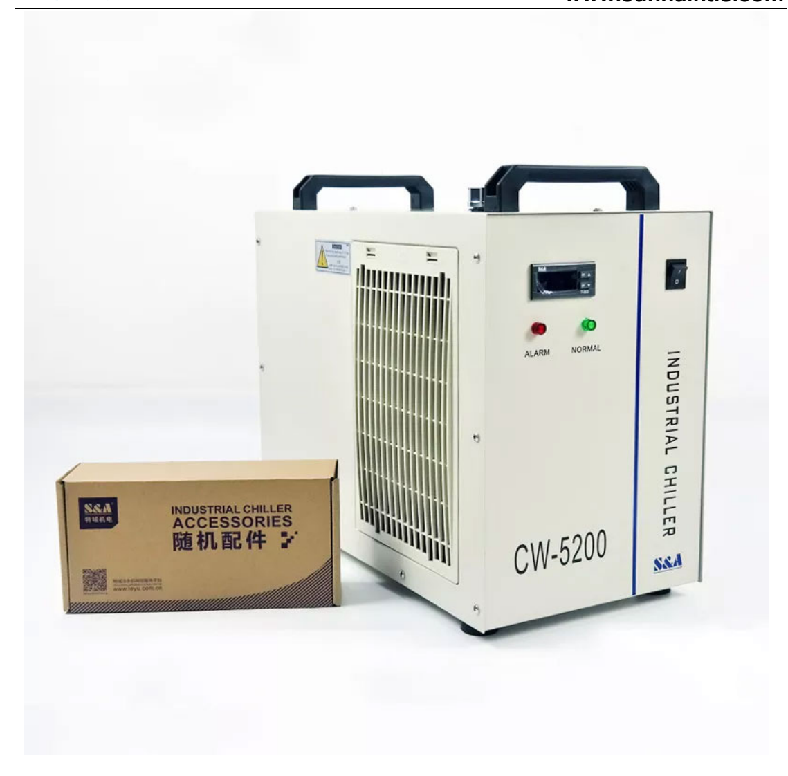
4/ Teyu S&A Brand water chiller CW-5000 or CW-5200