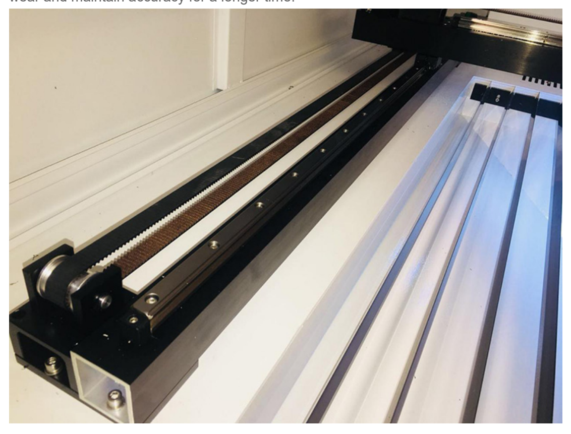
3. Platform Jinan Sunna International Trade Co.,Ltd.