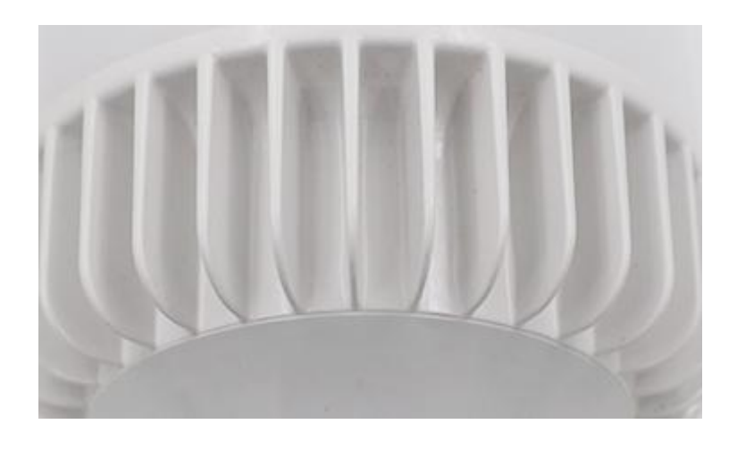
Die-casting Aluminum Lamp Body Die-casting Aluminum body and thermal plastic , More efficient radiating, Effectively improve the life span of lamp.