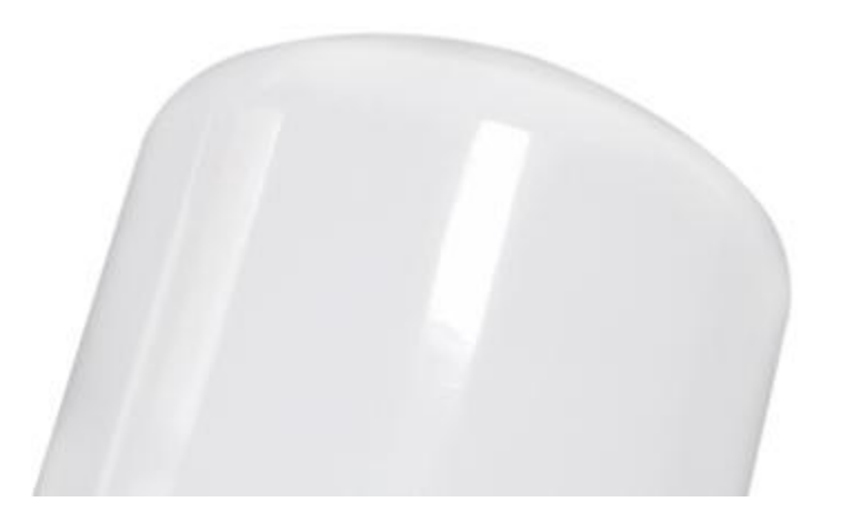
Transparent Light PC Cover High Transmittance PC material, Lighting transmittance up to 95%, not easily break, more safer and durable than traditional light cover.