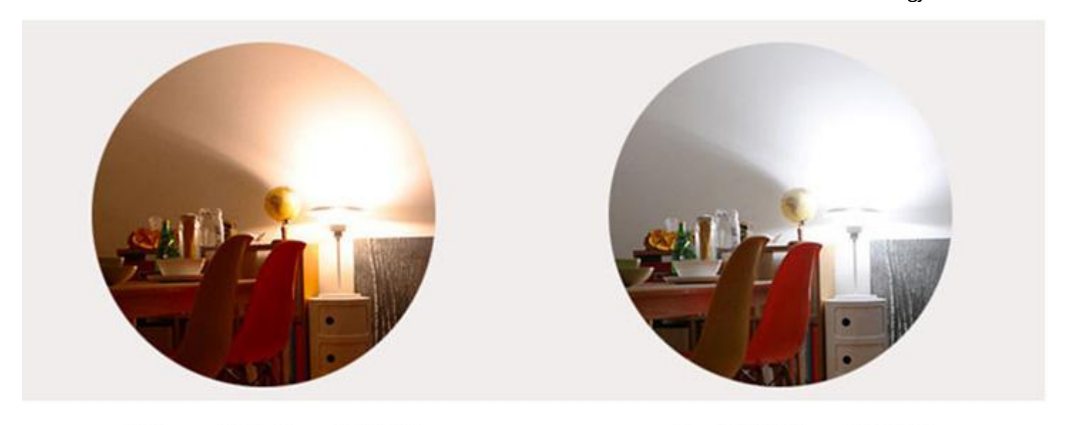
Warm White: 3000K Suitable for home decorating create warm atmosphere