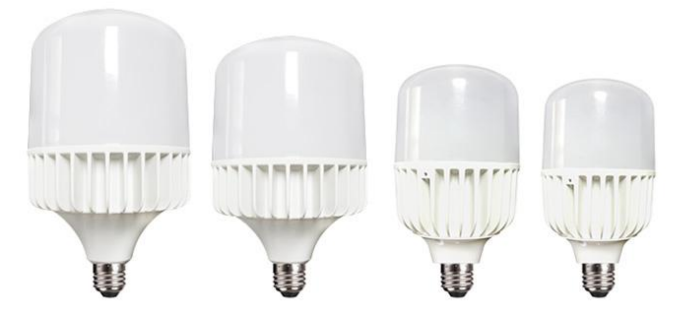
5.LED T80 T100 T120 T140 T160 High Power Light Bulb Qualification