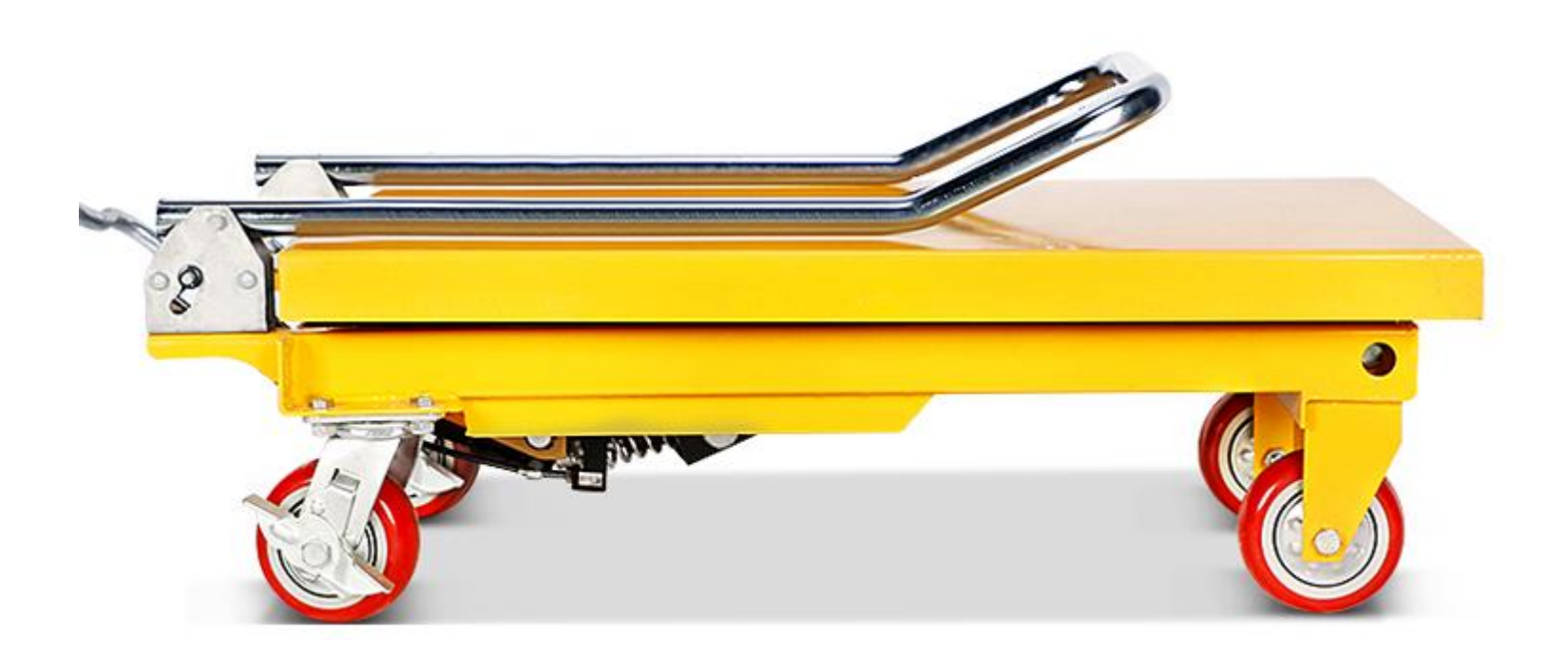
③Upgrading And Thickening Paint Countertops

The scissor fork is made of high-quality steel. It refuses to cut corners and cut materials to ensure the firmness of the product. Thickened shear forks increase the carrying capacity, ensure the safe and stable lifting of the cargo, and improve the safety of the vehicle.