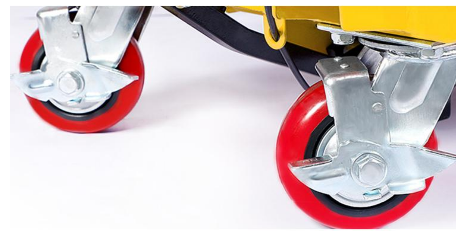
(4)split oil pump