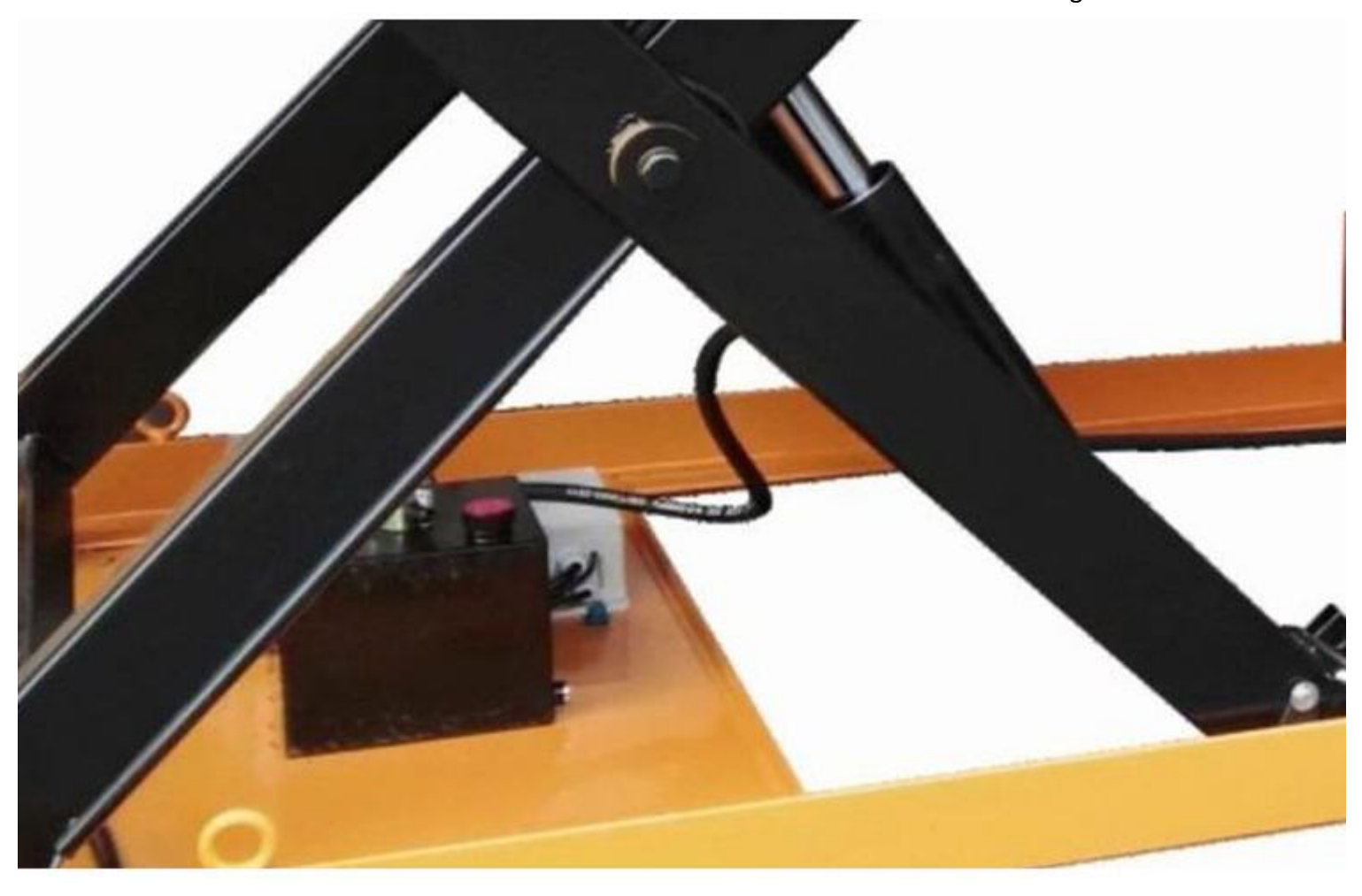
Upgrade the Electric Lifting Table's brake device to control the vehicle speed during use.