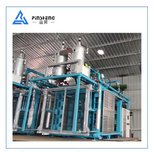
ready to serve you!