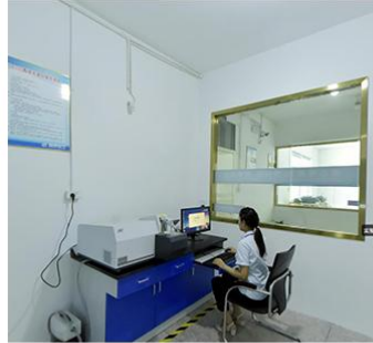
2、Spectrometer operation test