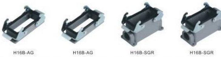
HDC-HSB-006-1 HDC-HSB-006-2 HDC-HSB-006-3 HDC-HSB-006-4 侧面进线/Side entry 正面进线/Top entry 侧面进线/Side entry 正面进线/Top entry