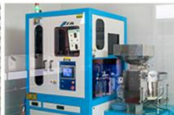
100% inspection equipment