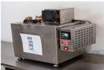
oil resistance tester