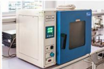
Electrothermal constant temperature dry box