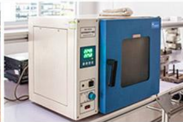
Electrothermal constant temperature dry box