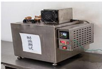
oil resistance tester