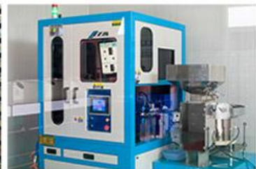
100% inspection equipment