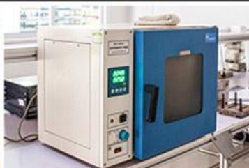
Electrothermal constant temperature dry box