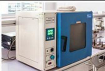
Electrothermal constant temperature dry box