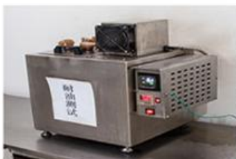
oil resistance tester