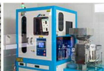
100% inspection equipment