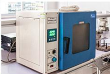
Electrothermal constant temperature dry box