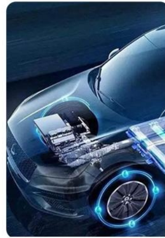
NEW ENERGY VEHICLE