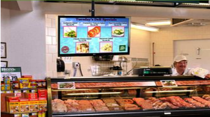
Application in label of product price