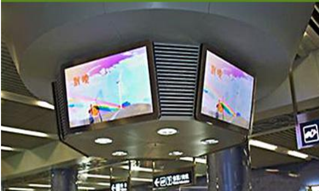
Application in mall