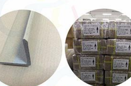
Double Layers Carton