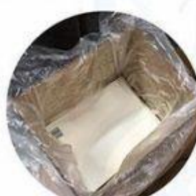
Water Proof Bag