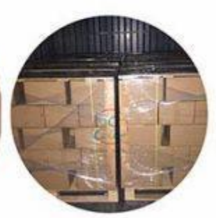
Wrapped Film and Tape