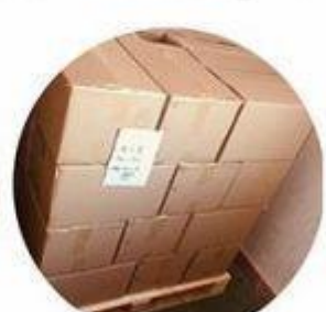
Load on pallet