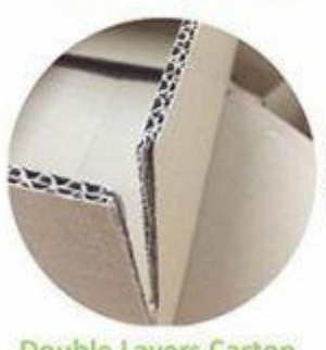
Double Layers Carton