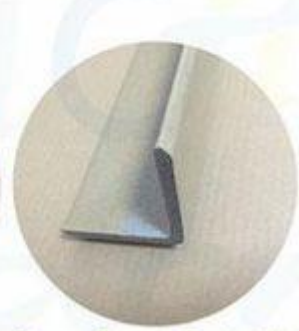
Strong Corner Protectd Wrapped Film and Tape