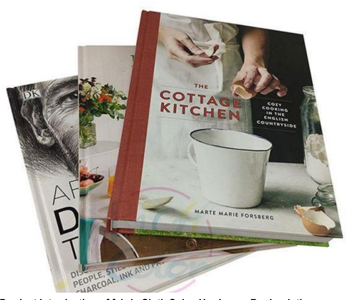
1.Product Introduction of fabric Cloth Spine Hardcover Book printing This stunning fabric Cloth Spine Hardcover Books appear to have a fabric or book cloth spine and a paper cover, like this below.

Tel: +86-755-29057711 E-mail: <u>info@wowrichprinting.com</u>