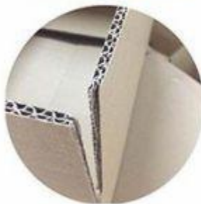
Double Layers Carton