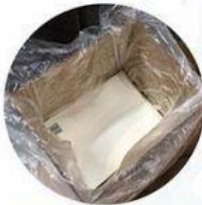
Water Proof Bag