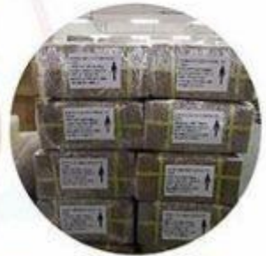
Wrapped Film and Tape