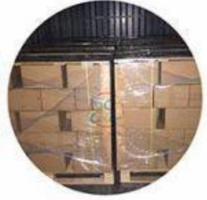
Wrapped Film and Tape