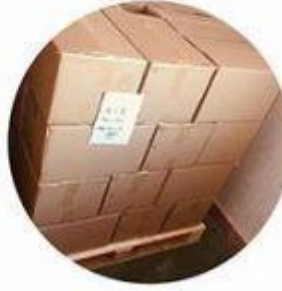
Load on pallet