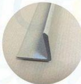
Strong Corner Protectd