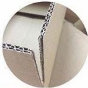
Double Layers Carton