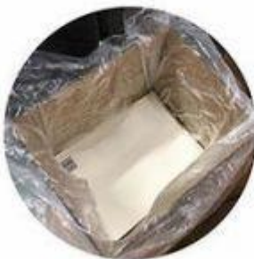
Water Proof Bag