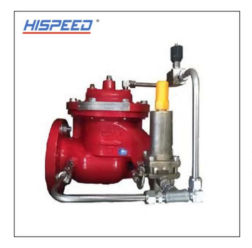
long term partner in China.