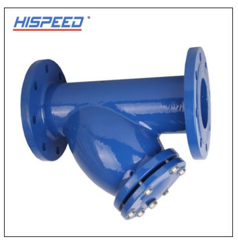
long term partner in China.