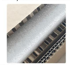
PP Cotton + Thickened Honeycomb Cardboard