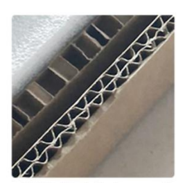
3CM Thickened Honeycomb Cardboard