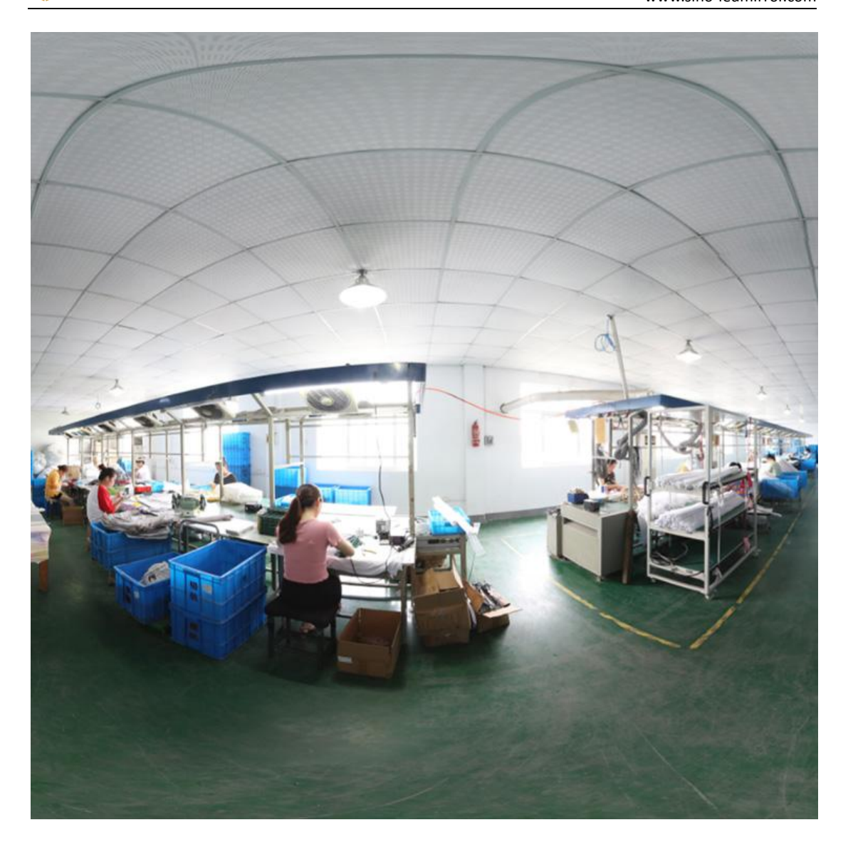
Deliver, Shipping And Serving

Double Sides Round LED Makeup Mirror Magnification deliver with below shipping package: